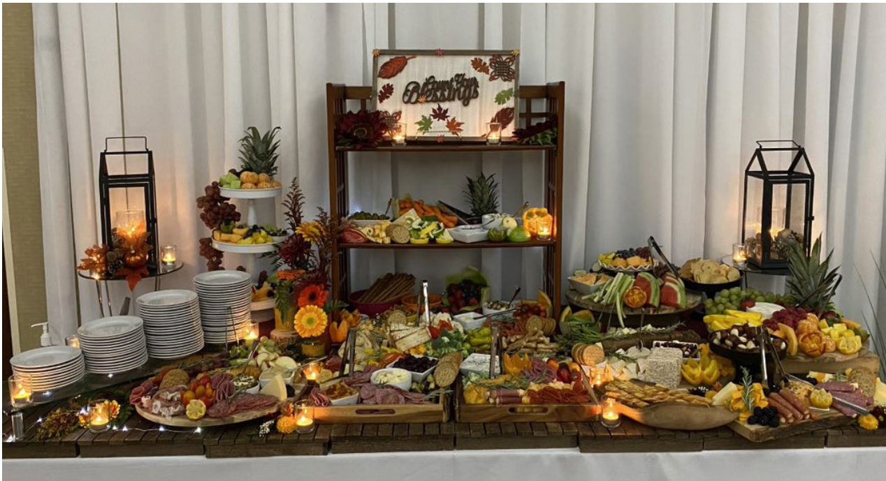
Spectacular Charcuterie Display! (See page 6 for details and pricing)

Check out our reviews on Google, The Knot, Wedding Wire, Facebook, and our website!